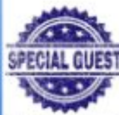
CLUB VISITATION REPORT